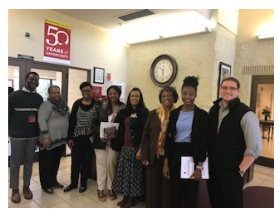
EOA Staff, Babcock Faculty and Gerontology interns