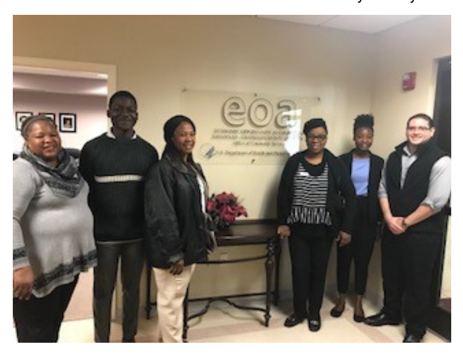
EOA RSVP Supervisors, Babcock Faculty and interns